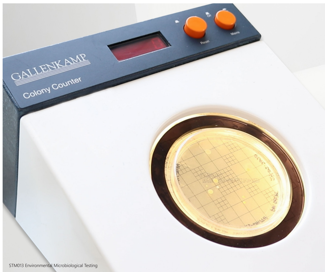
STM013 Environmental Microbiological Testing

All testing is unaccredited unless specifically stated in the test title.