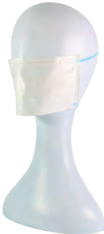
FACEGUARD 2 FACEMASK WITH EARLOOPS