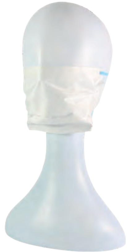
FACEGUARD 3 FACEMASK WITH HEADLOOPS