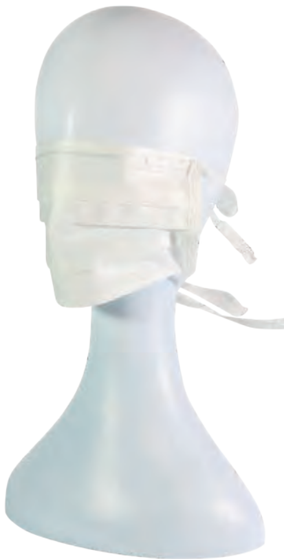
FACEGUARD 1 FACEMASK WITH TIES