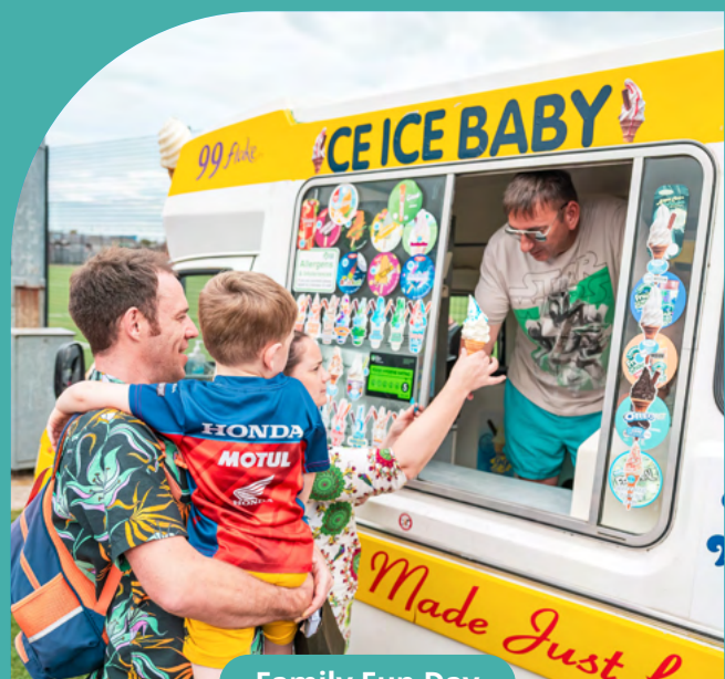
Family Fun Day

Our vision is clear, to be a responsible employer, a trusted community partner, and a catalyst for sustainable growth. By empowering people, protecting the environment, and promoting equality, we are building a cleaner, fairer, and more resilient future together.