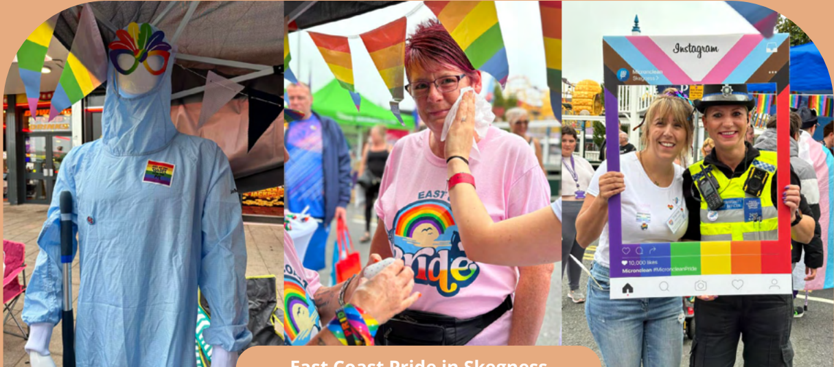
East Coast Pride in Skegness