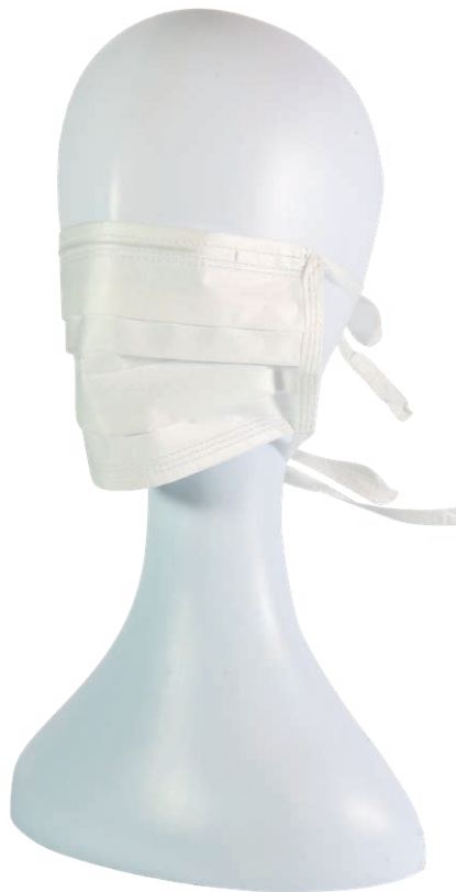
FACEGUARD 1 FACEMASK WITH TIES