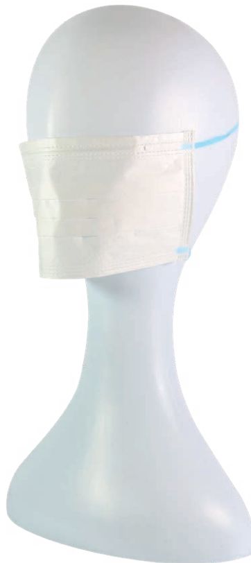
FACEGUARD 2 FACEMASK WITH EARLOOPS