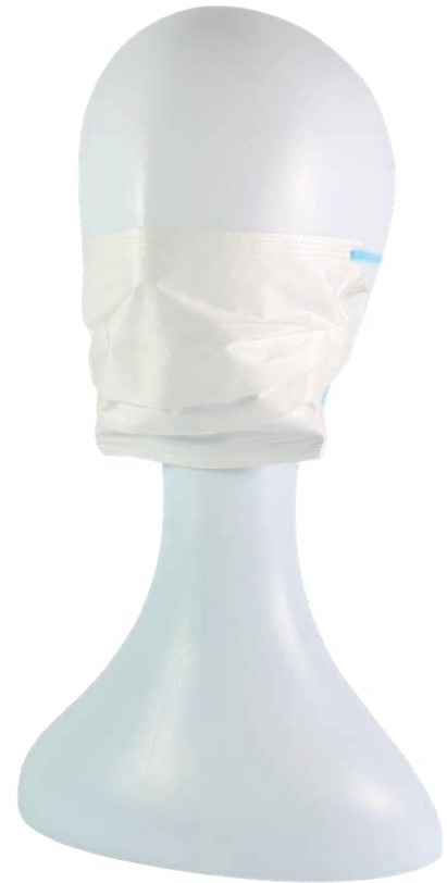
FACEGUARD 3 FACEMASK WITH HEADLOOPS